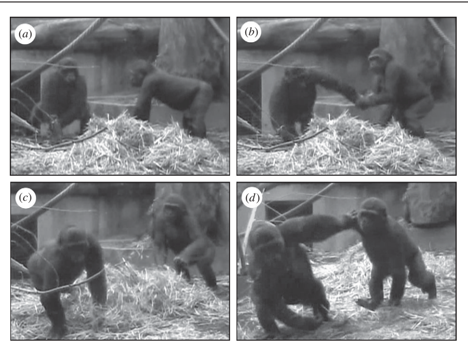
Figure 2. 'Hit-and-run' in gorillas. The individual on the left (a,b) hits the individual on the right and (c,d) then runs away. The individual on the right (c,d) responds by chasing. Seven of eight subjects displayed this behaviour (electronic supplementary material, video).

latter ones predominantly displayed open-mouth faces while running after their playmates and hit them more often at the end of the chase than vice versa. Such distinctive play roles might help individuals to acquire more refined communicative skills, integral for a wide range of social contexts [13]. The capacity to take the perspective of others might be enhanced by such role play [14,15], which forms an important prerequisite for empathy-related behaviours in [16]. Reversals of these humans distinctive chase roles in the gorillas of this study occurred consistently after hitting, similar to the game of tag in children [7,8].